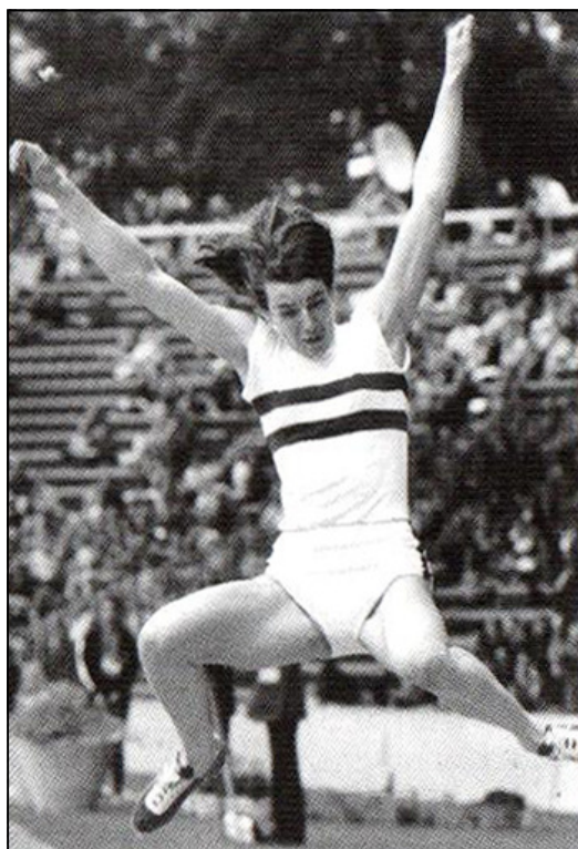
History of Welsh Athletics